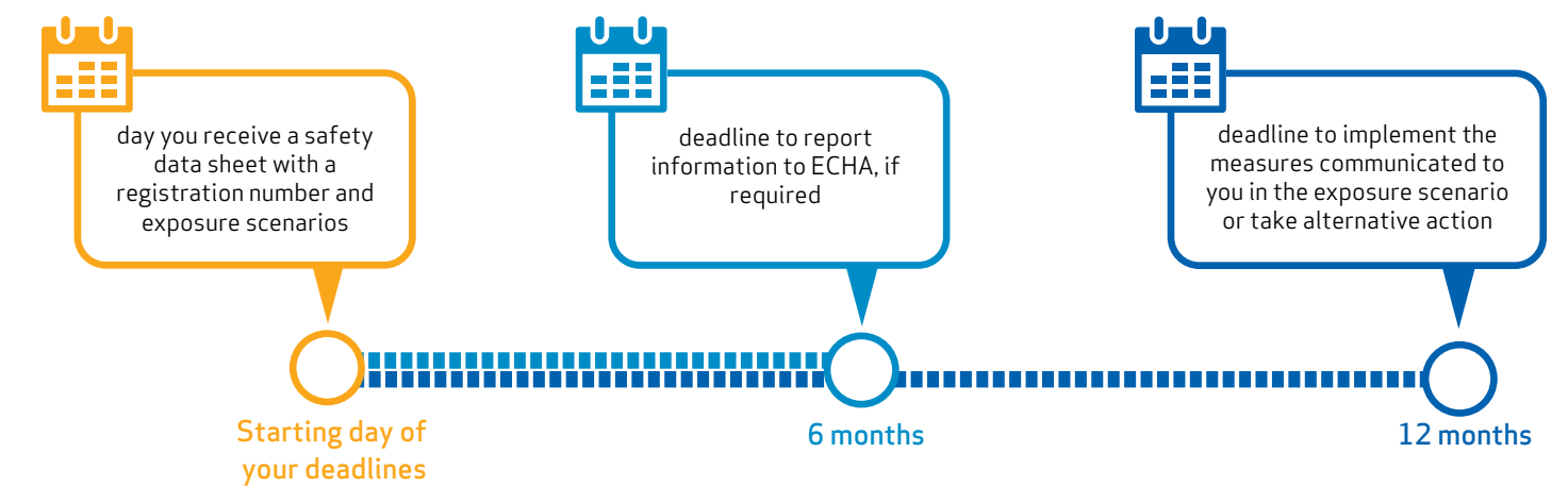
Figure 1: REACH timelines for implementing downstream user obligations

» https://echa.europa.eu/practical-guides